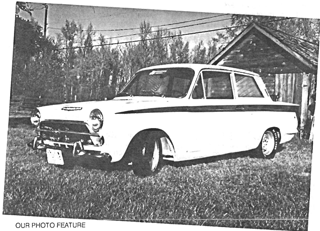
OUR PHOTO FEATURE

This issue of Lotus Lines appears sooner than expected to catch up with cover dates. The intent is to produce an issue before the club meeting every other month, in the first of the two-month cover date. Ergo next issue should appear mid-May.