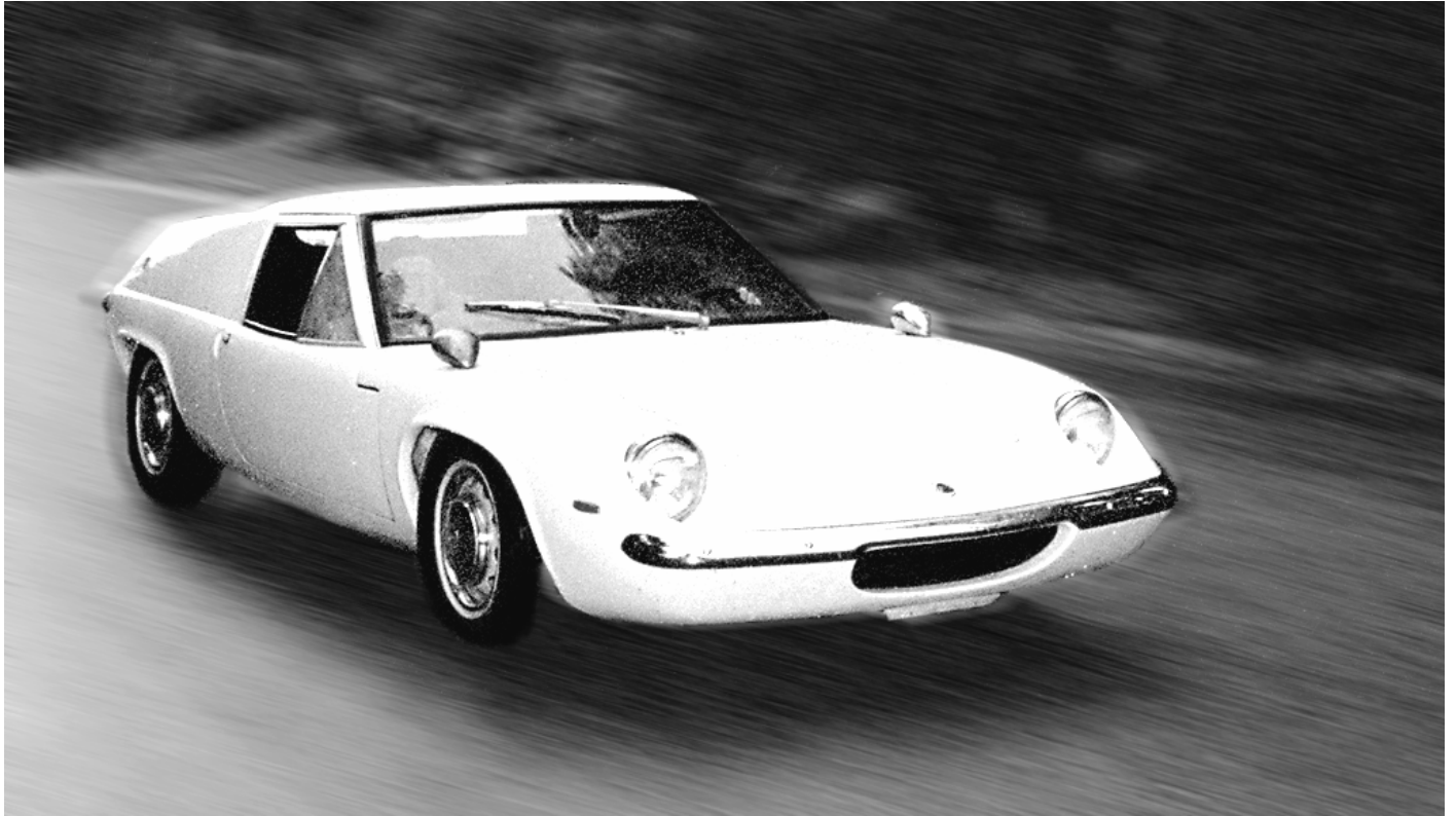
An example of Brandy Galos digital photo editing on their Europa S1

Newsletter of the Evergreen Lotus Car Club